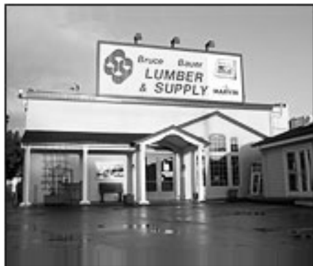
Mountain View, CA 2001

The family owned store has been in the present location since 1971. "As a family owned business we are close to our customers, this enables us to recognize change in the marketplace and react quickly, for example the demand for "Green Products." We are in a highly educated consumer market. Our customers understand and appreciate the value of quality products and the added value of our outstanding customer services."