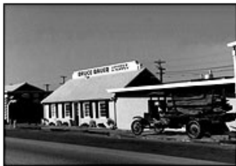
San Carlos, CA 1991

Bruce Bauer then expanded its inventory to include basic plumbing and electrical supplies, to round out its home improvement materials and services inventory. Bruce Bauer also has a senior citizen discount program.