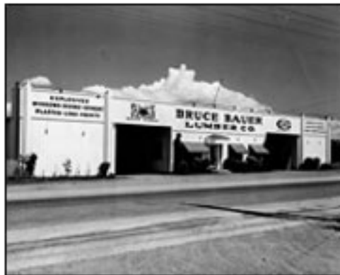
Medford, Oregon 1945

Originally opened as a contractor lumber yard, over the years we developed into a do-it-yourself home center with strong emphasis on practical advice to home owners as a part of our value added service and quality merchandise.